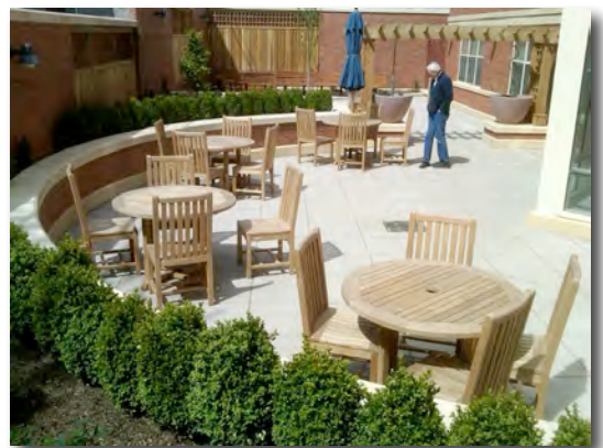
Hull's large courtyard is a festive gathering place for residents.