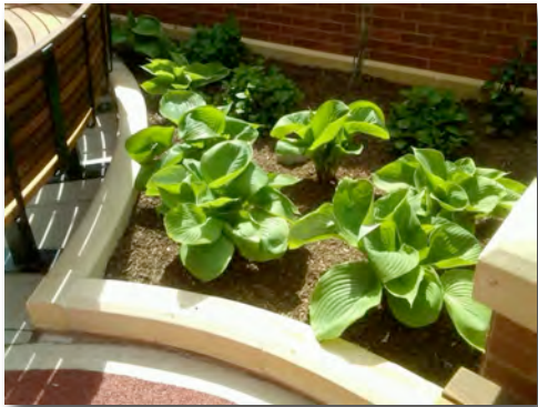
New plantings make the Hull Residence backyard especially welcoming.